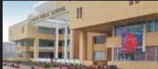
Delhi Public School