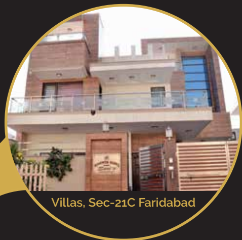
Villas, Sec-21C Faridabad