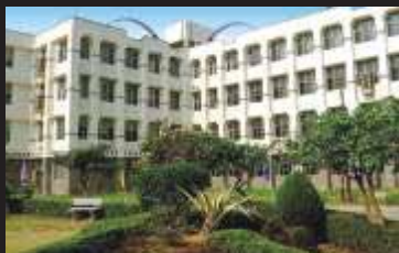
Sudha Rustagi Dental College

Renowned colleges like YMCA College of Engineering, CITM, Manav Rachna International University, Lingaya's University, Institute of Management & Technology, and newly developed medical & dental colleges, all within 5 minutes.