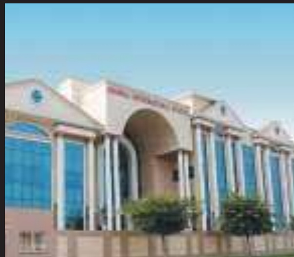
Aravali International School