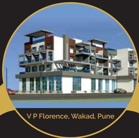
V P Florence, Wakad, Pune