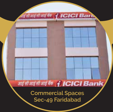
Commercial Spaces Sec-49 Faridabad