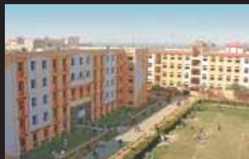
Lingaya's Institute of Management and Technology