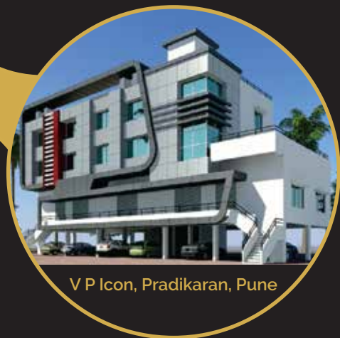
V P Icon, Pradikaran, Pune