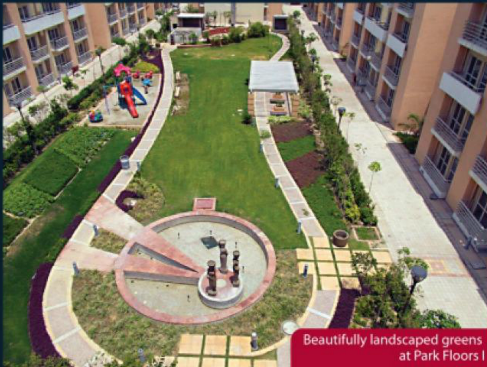
Beautifully landscaped greens at Park Floors I

*Architects and the developer reserve the right to alter specifications and facilities for design improvement.