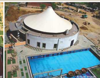
Club & Swimming Pool