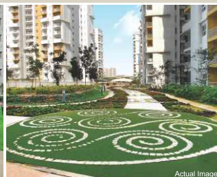
Beautifully Landscaped Greens