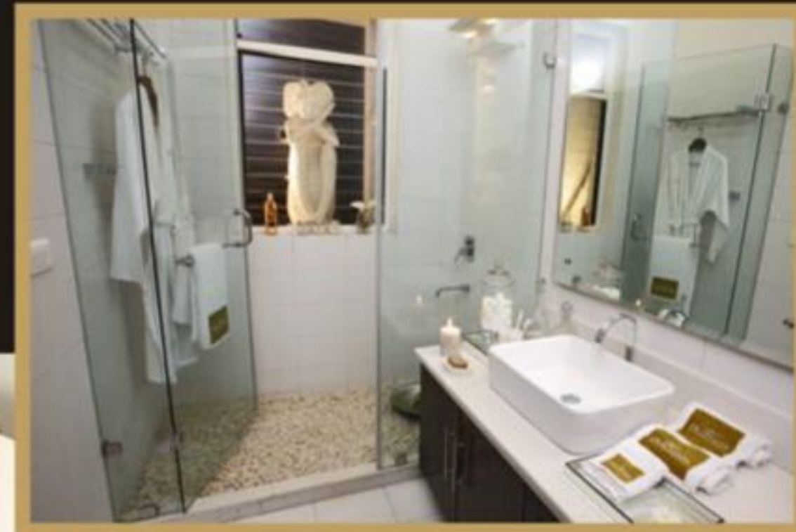
Actual Sample Apartment Picture