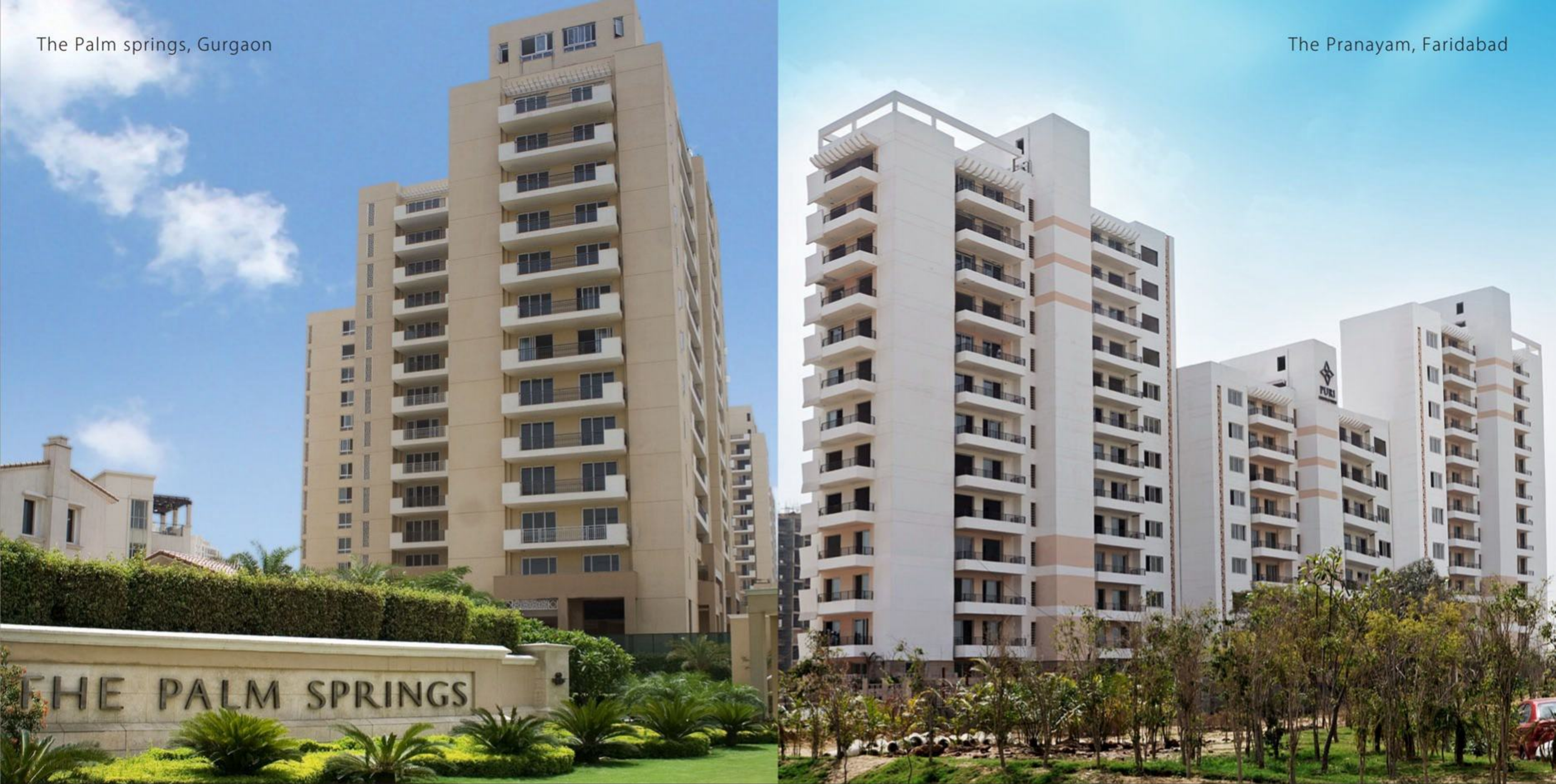
The Pranayam, Faridabad

Brought to you by the creators of The Pranayam, Faridabad and The Palm Springs, Gurgaon