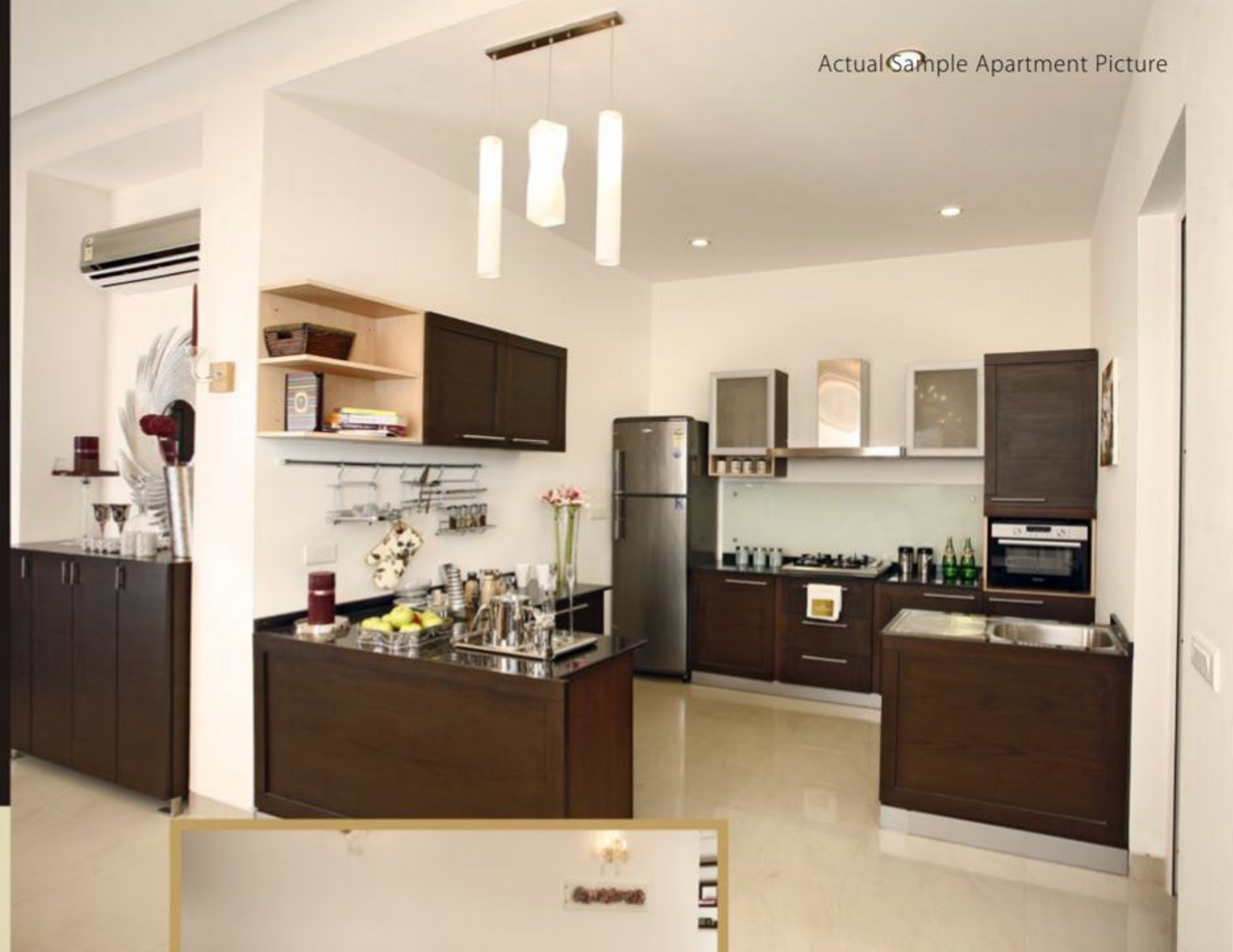
Actual Sample Apartment Picture