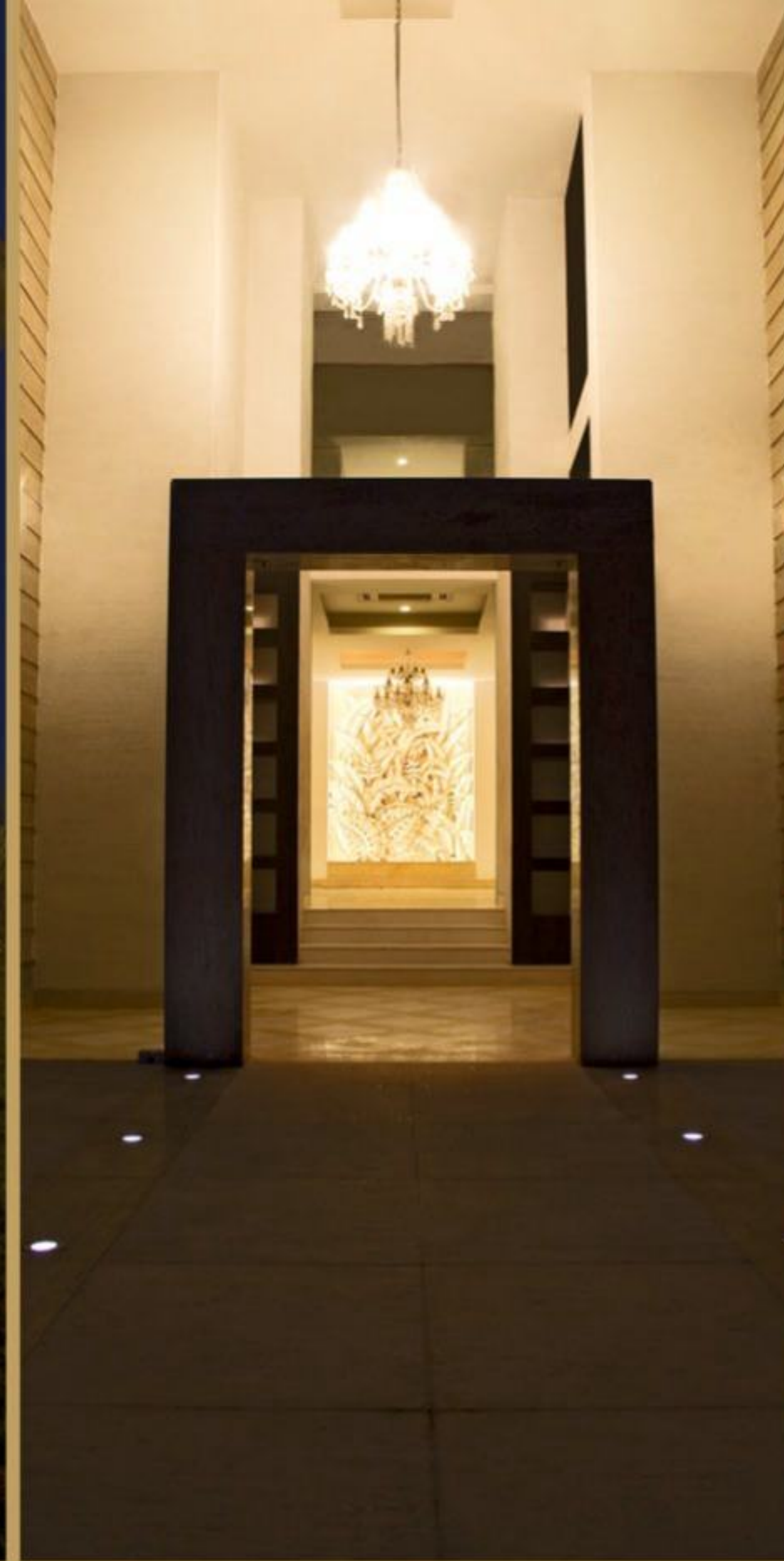
Elegant Entrance Lobby