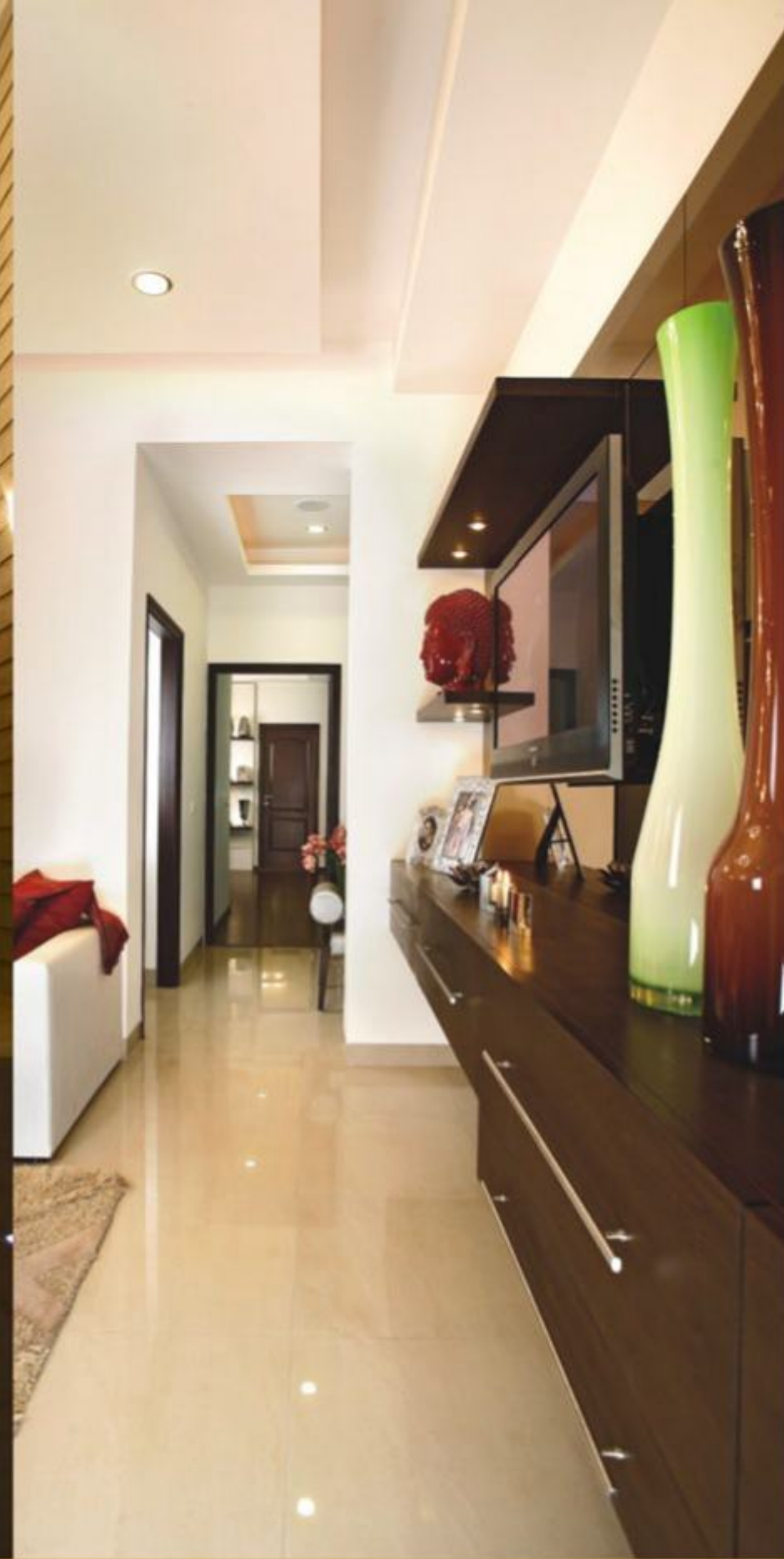
Maximum utilization of space