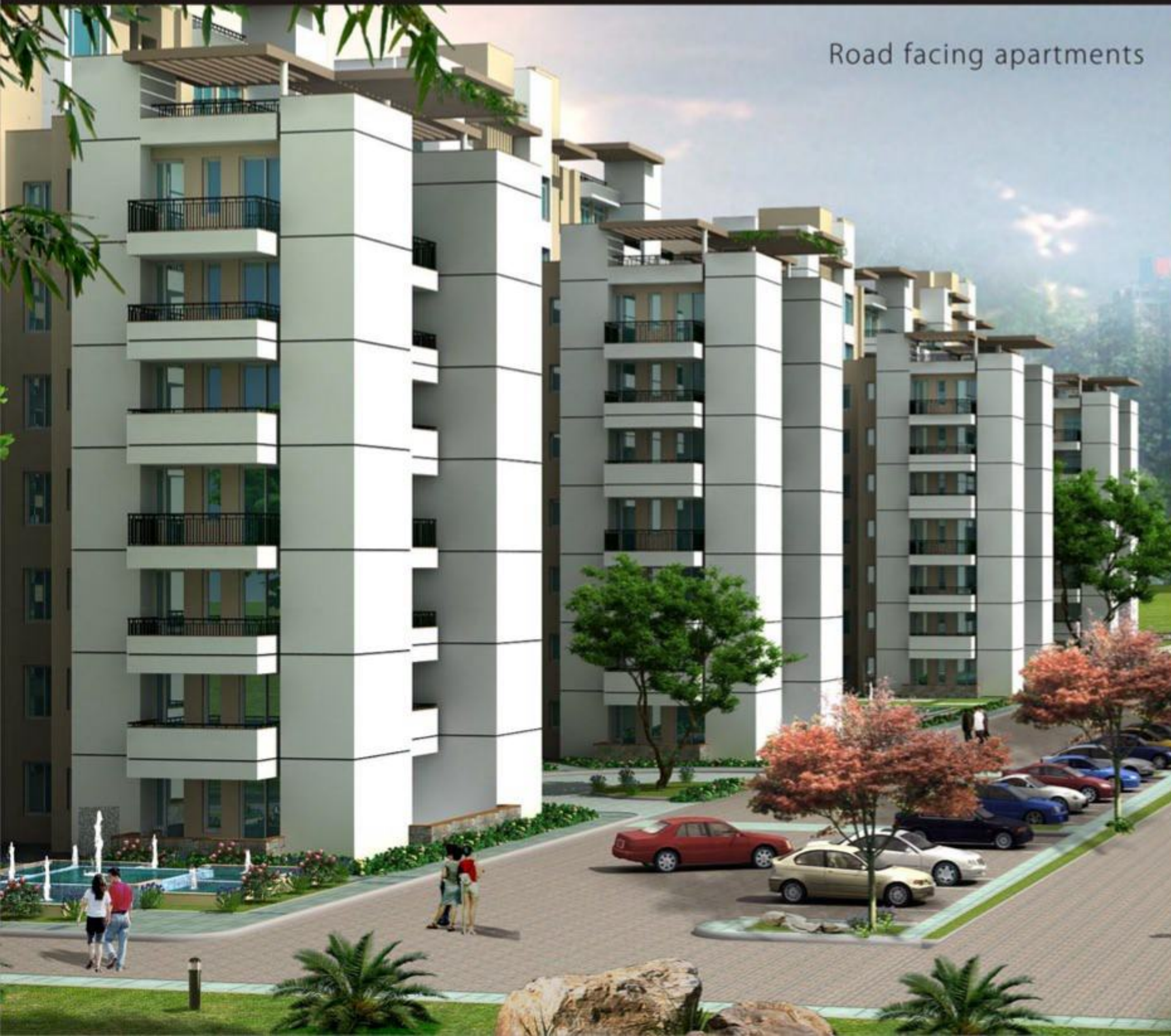
Road facing apartments