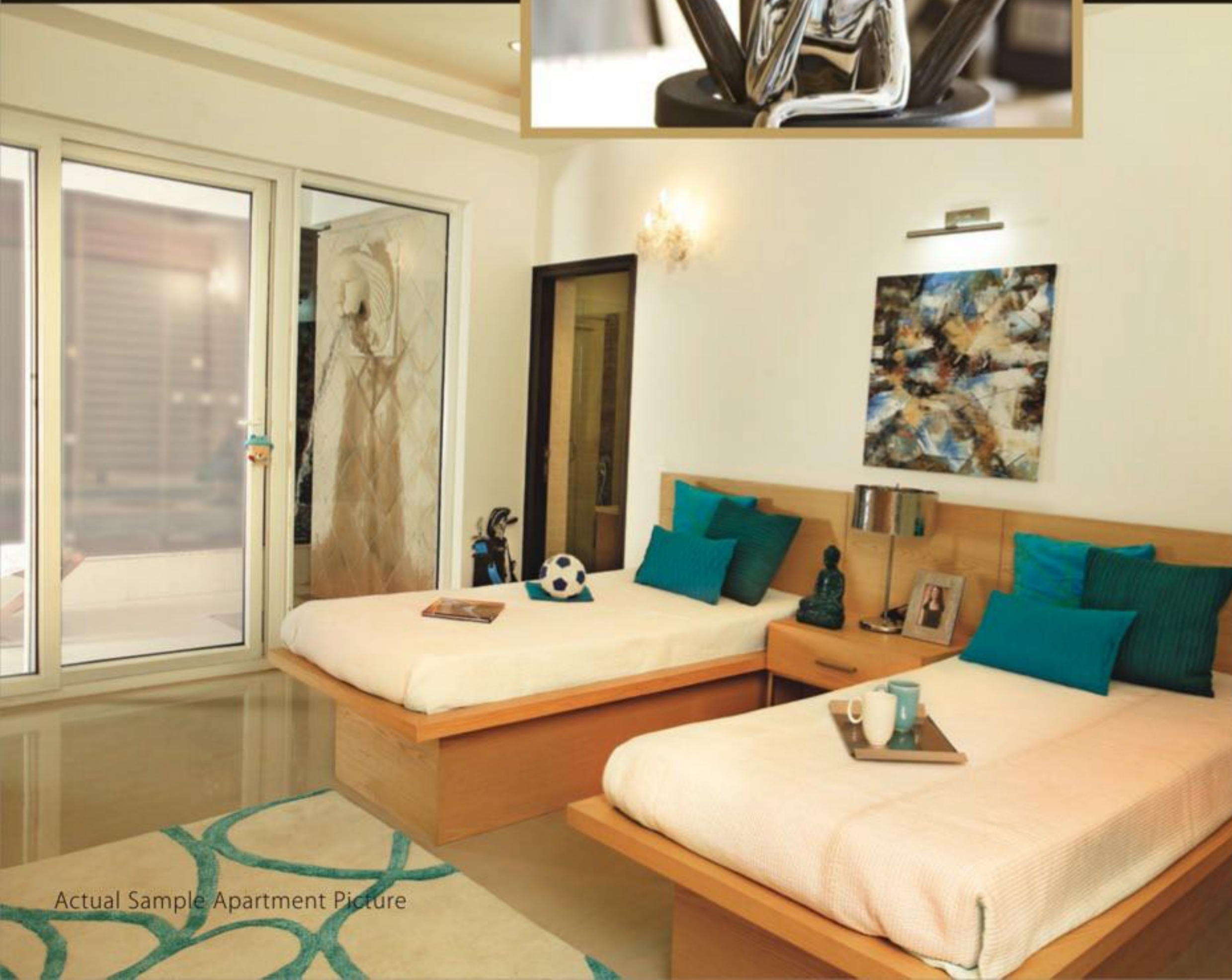
Actual Sample Apartment Picture